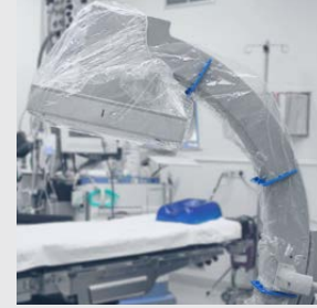
C-Arm Ayarlanabilir Klipsli örtü